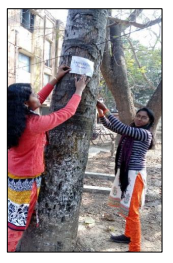
(B) Naming of plants